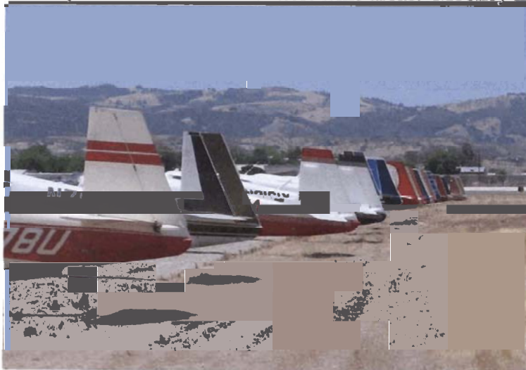
The prettiest tails in the world!

the day, folks toured the Estrella Warbirds Museum ( http://www.ewarbirds.org/ ), had front row seats to watch an Aerobatic Competition, and even went wine tasting in Paso Robles, one of California's hottest wine areas. Mooney models ranged from M20A to