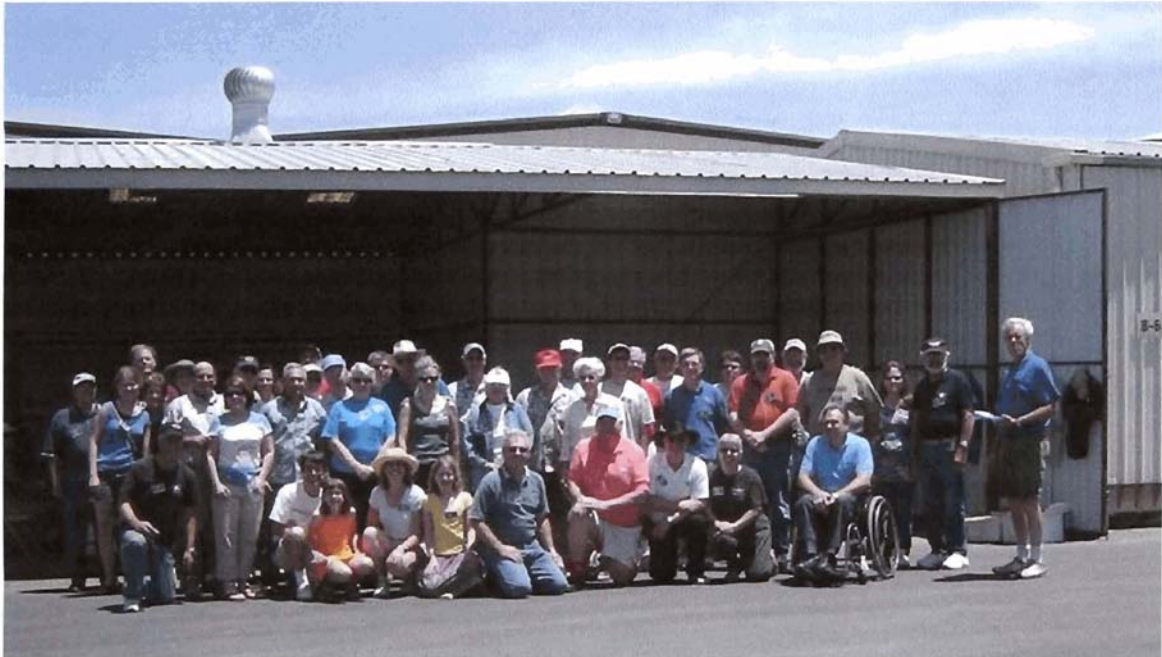
Mooniacs, One & All!